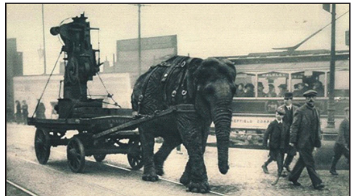
A former Circus elephant works in the Sheffield Coal fields

He ended this adventure posted to the 4th Army Corps as Elephant Advisor to the Elephant Company of the Royal Indian Engineers. Elephants were used as "sappers" i.e. as part of the Royal Engineers for use in bridge build-