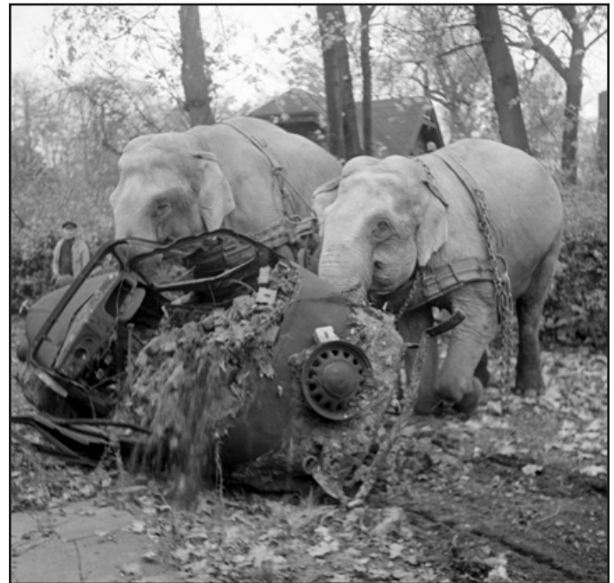
Debris removal in Berlin, circa 1945