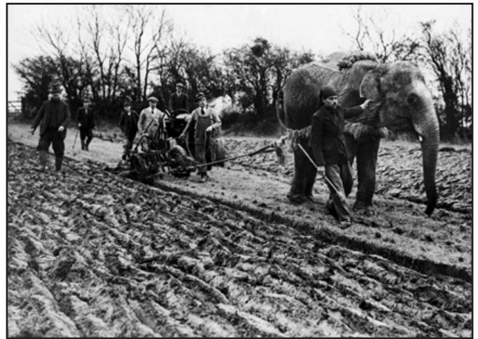
Plowing in Towcester, 1939