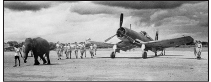
Aircraft tow in the Far East.

One would expect to see elephants in service in the Far East, where they had been used for logging and other commercial purposes for hundreds of years, but it was very unexpected to see them in use in Europe, both in WWI and WWII, on the continent and in England.