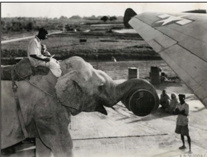
Fuel to get over the Hump