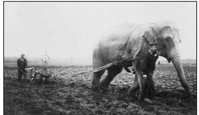
Plowing in Belgium, 1915