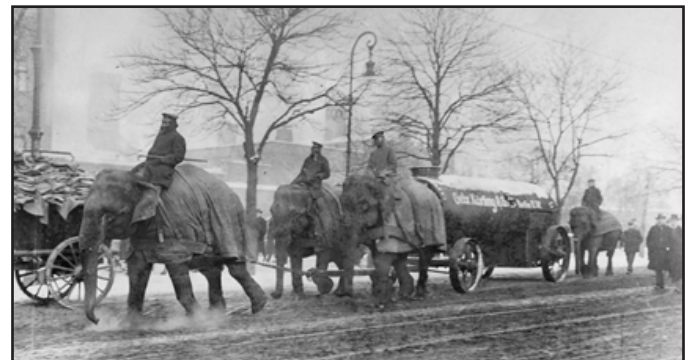
German Army Service in Berlin, 1917