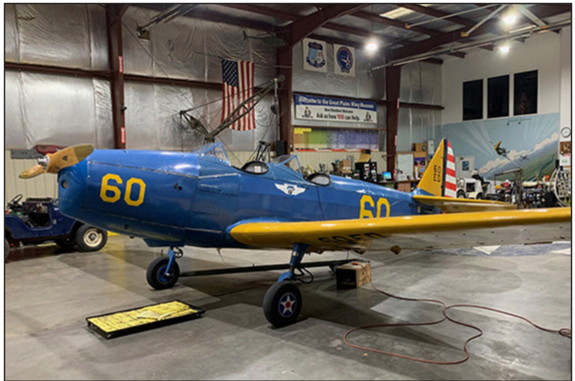
Airplanes = Maintenance